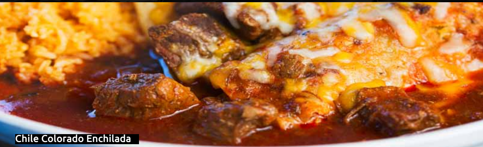
Chile Colorado Enchilada

SEASONED GROUND BEEF • SHREDDED CHICKEN • CHEESE • BEANS