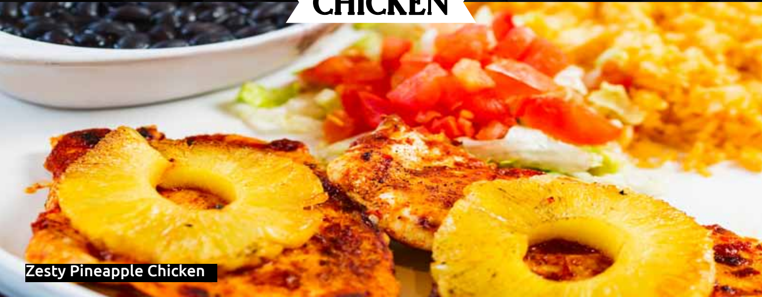
Zesty Pineapple Chicken