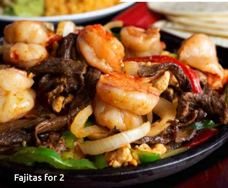
Fajitas for 2

We'll deliver them sizzling on a skillet with onions and green peppers, along with warm tortillas, lettuce, tomatoes, and THE WORKS. Comes with Spanish rice and homemade refried beans. Add grilled pineapple chunks 0.50. GF with corn tortillas!